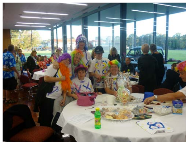
The Quiz Night...one of the best dressed tables